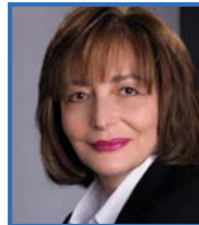
Dorann Gottlieb Legend Award