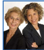
The Feldman Group *